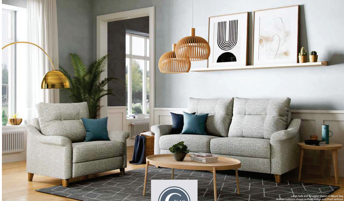
Large Sofa and Snuggler shown in Moore Sea. Scatter cushions shown in Plush Indigo and Plush Airforce.