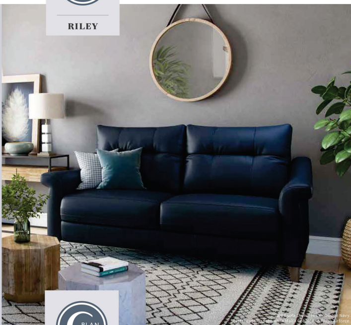
Large sofa shown in Cambridge Navy. Scatter cushions shown in Plush Indigo and Plush Airforce.

Main cover and contrast stitching options can't be swapped. If contrast stitching is not selected, the furniture will be supplied with self-coloured stitching.